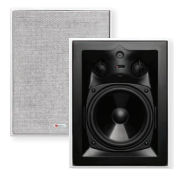
HSi 475T2 6½" Stereo In-Wall Speaker